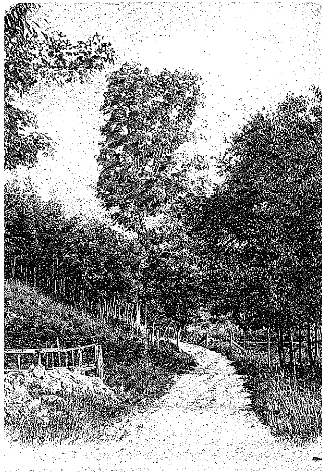
"Driveway" City Park, Petoskey, Mich.