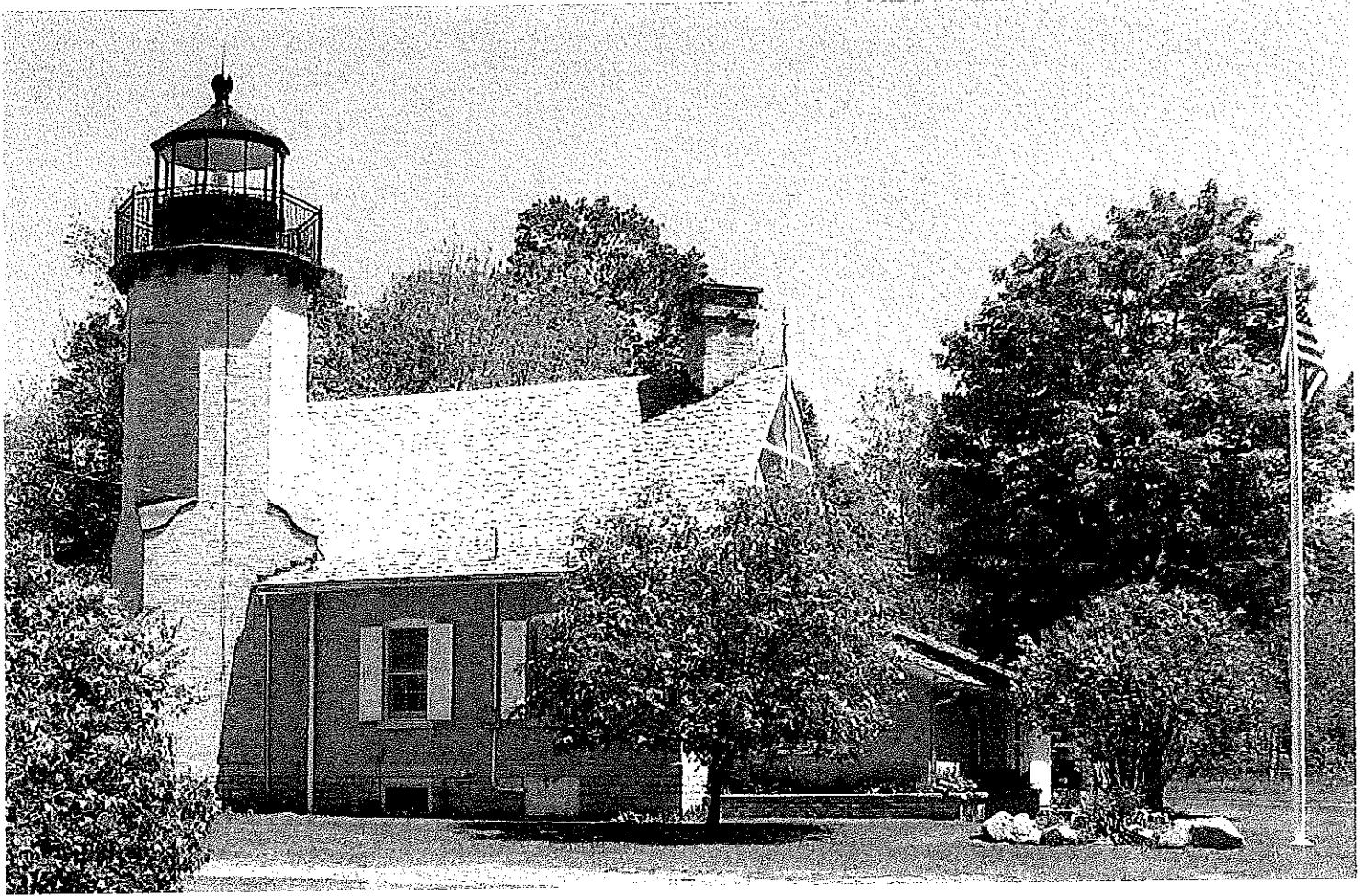
Restored McGulpin's Point Lighthouse - June 12, 2009