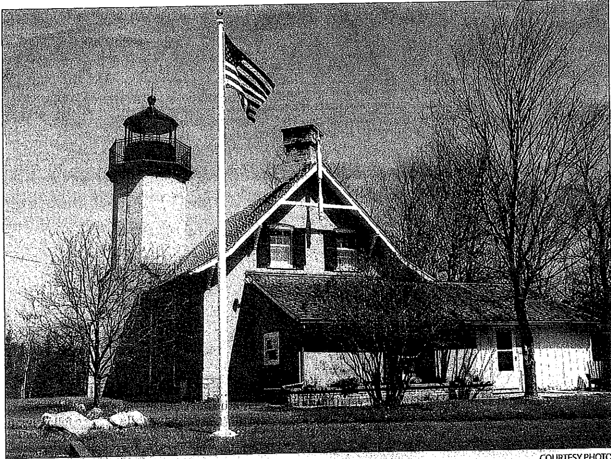
The McGulpin Point Lighthouse