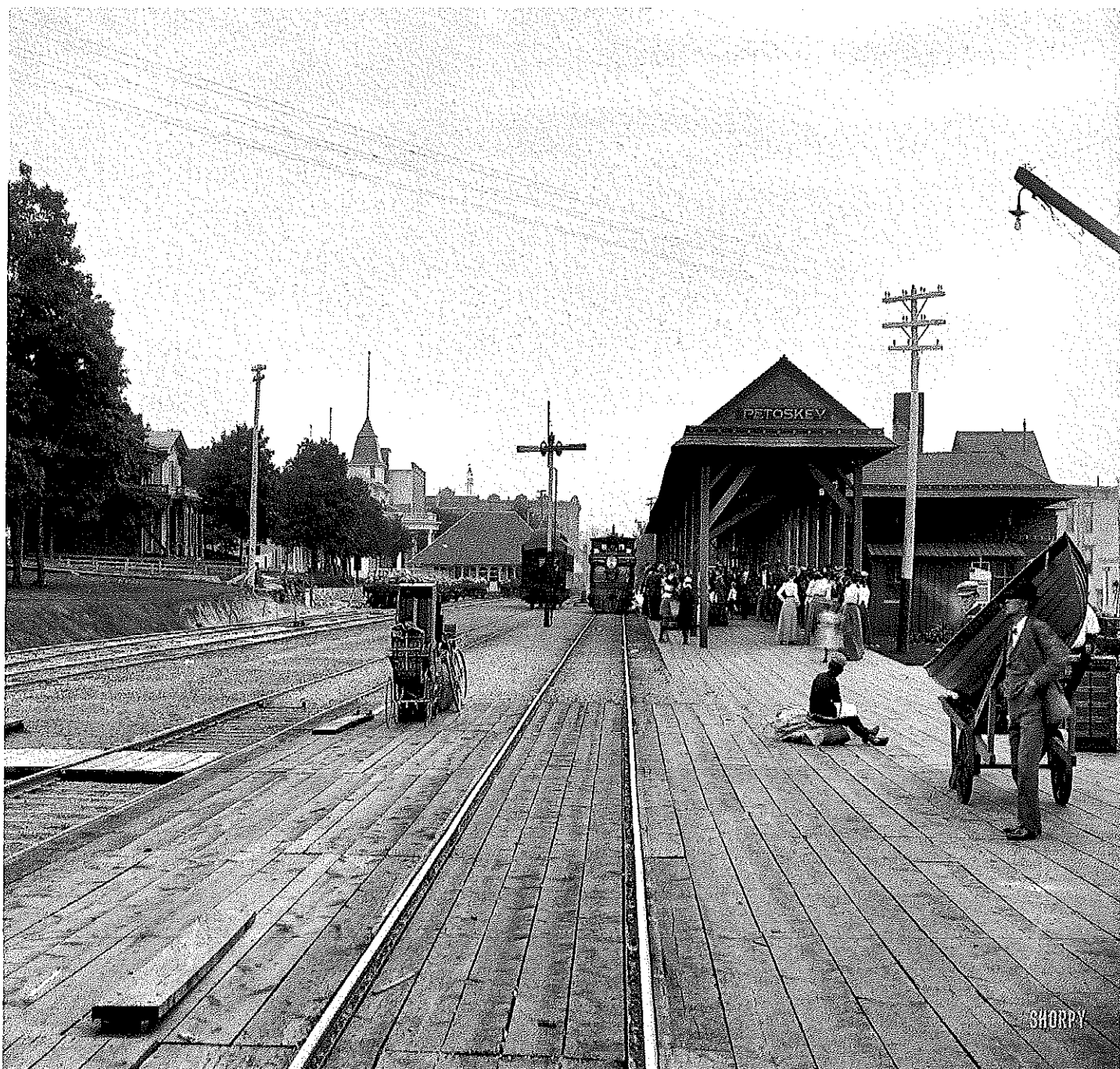
“Grand Rapids and Indiana R. R. Station” Petoskey, Michigan 1901