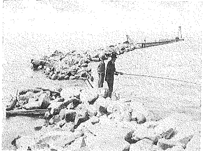
Breakwater & Light House, Petoskey, Michigan