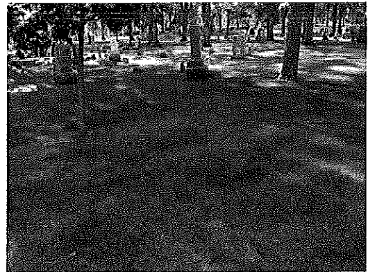
Greenwood Cemetery Petoskey, Emmet County, Michigan Section G, Block 54, Lot 1