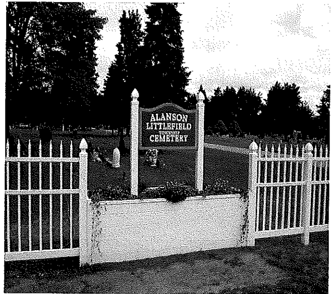
Alanson Littlefield Township Cemetery