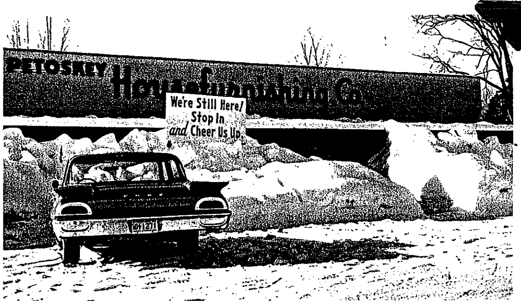
After a long blizzard, this business still has a sense of humor, March 1962.

Looking out over the tannery in Kegonic and the "Par-4 Corner" near Petoskey, circa 1947.