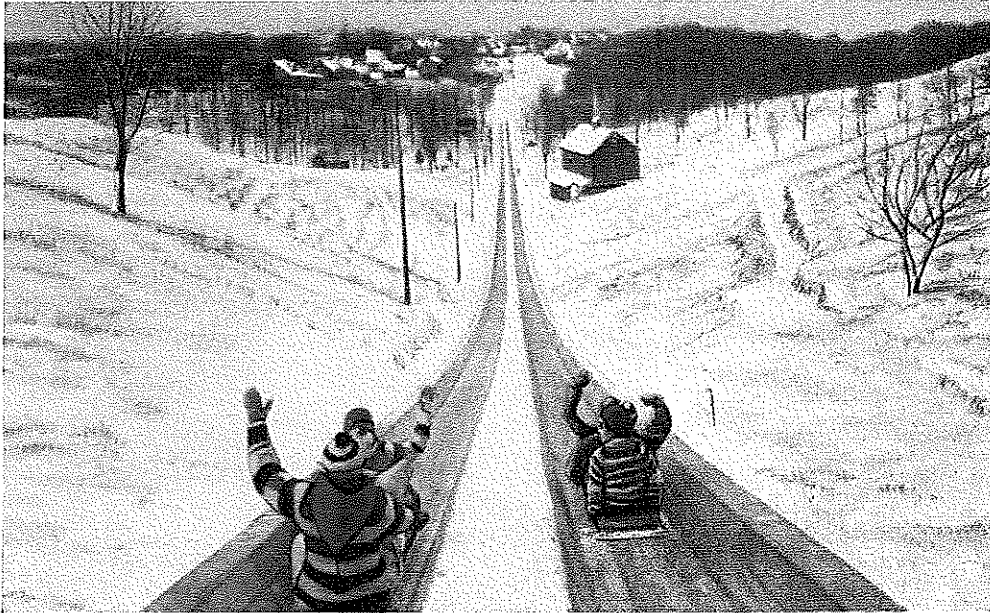
62 Tobogganing at City Park, Petoskey, Michigan