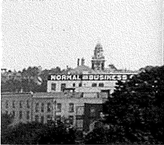
In the background {above the Normal Business College sign} is the county building clock tower {since torn down} The clock is down on the waterfront now.