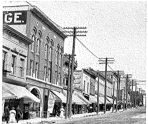
Circa 1908. Notice sign {top building} looks fairly new.

Petoskey Record Local News, 2 nd column Wednesday, September 11, 1901