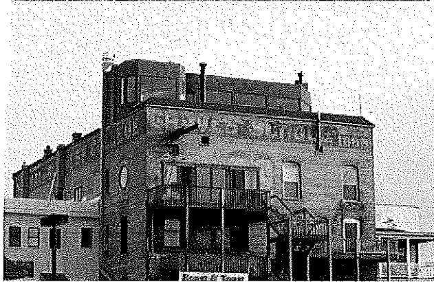
EAST & NORTH FACING GRAVES NORMAL SCHOOL SIGNS (2013):