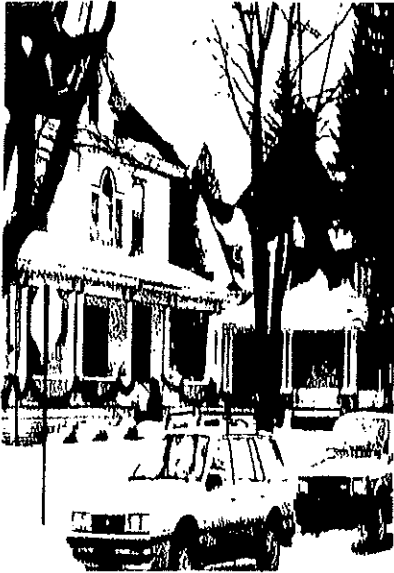
HOMES ALONG Mitchell Street are included in the East Mitchell historic district.

Petoskey News Review Friday, February 13, 1967, front page