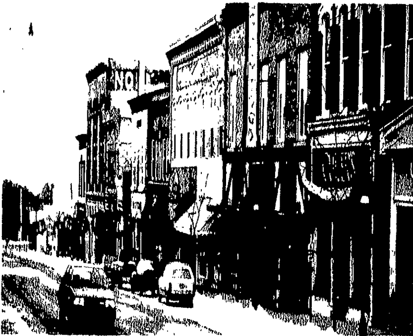
PETOSKEY'S GASLIGHT district is included in the downtown historic district.

Leech said the city eventually hopes to get designation plaques and markers to identify the districts. Individual property owners also can get markers indicating their building is listed as a historic site.