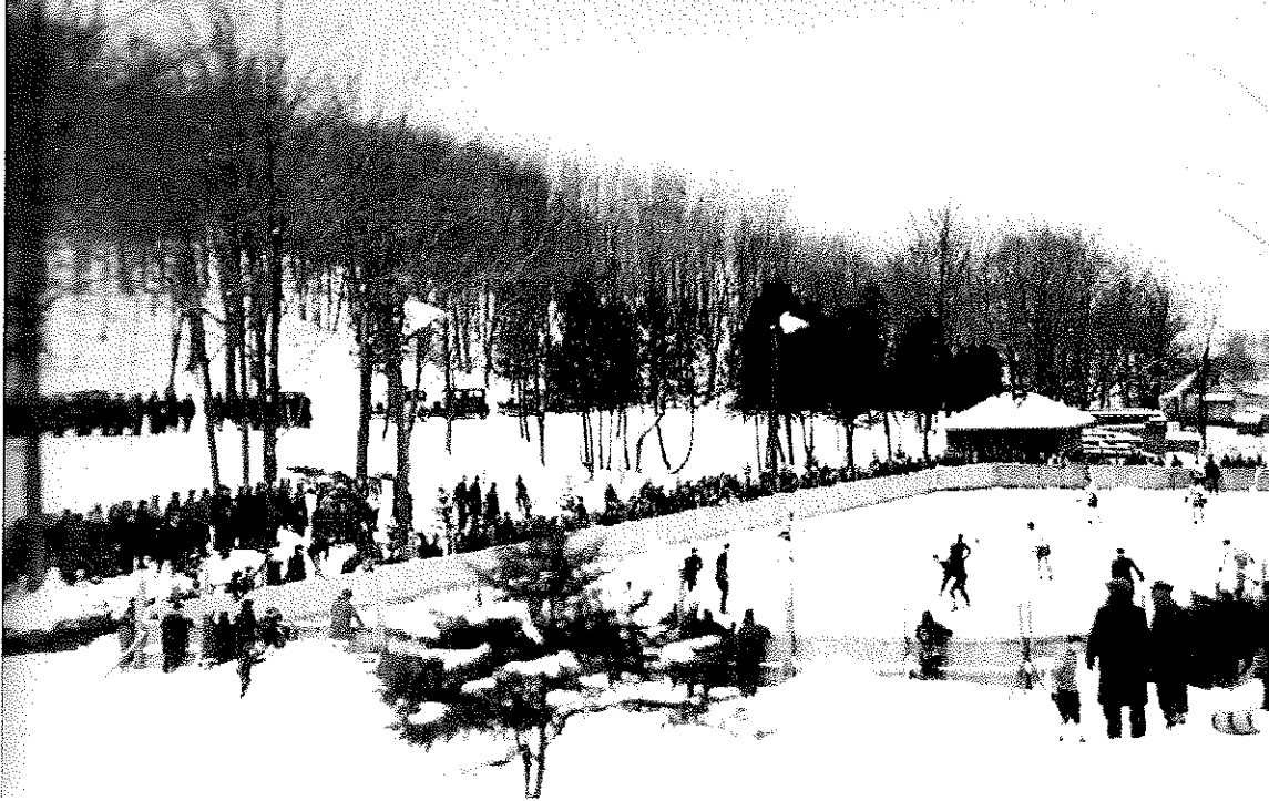
Hockey Game in session at Petoskey Winter Sports Park Date Unknown {notice the automobiles below the hill}