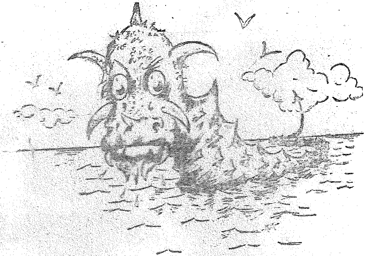
THE PETOSKEY SEA SERPENT