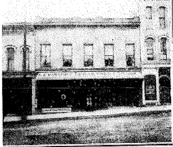
Levinson's Department Store Now Hollywood Arcade Stores

On the second floor we find a fine assortment of ladies cloaks and suits, a good many of which are the "Redfern" and "La Vogue" brands. Also the millinery and trunk and valise departments are located on this floor and both come up to the general standard of excellence. You will be amply repaid for your time spent here by the saving made on your purchases at Levinson's.