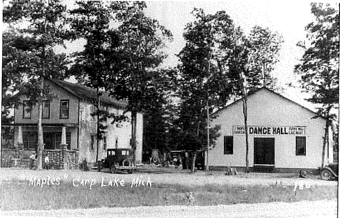
"The Maples" Date unknown Carp Lake, Emmet County, Michigan