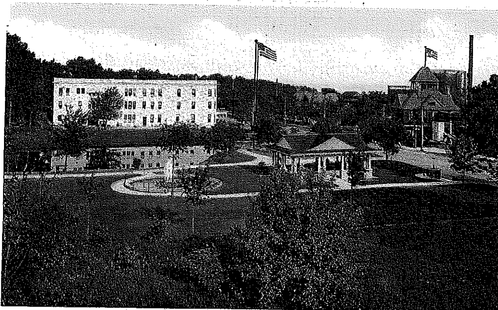
45 MINERAL WELL PARK AND PETOSKEY HOSPITAL, PETOSKEY, MICH.