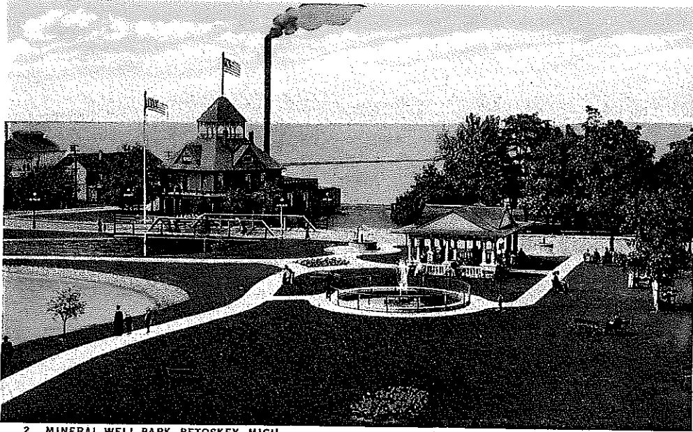
2 MINERAL WELL PARK, PETOSKEY, MICH.